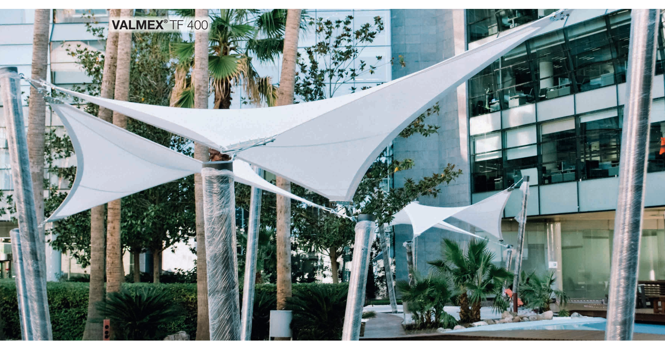
Design, Manufacturing & Installation: Carpatec